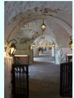
Forte de São Brás