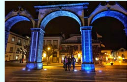
Portas da Cidade