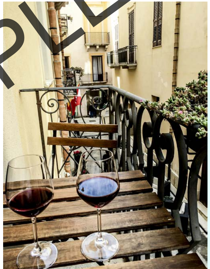
Balcony Badia Nuova