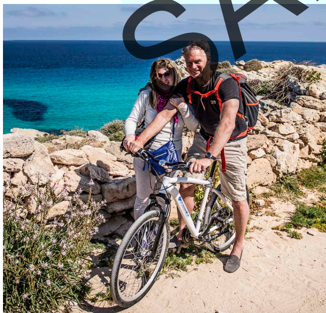
Favignana Bike Ride