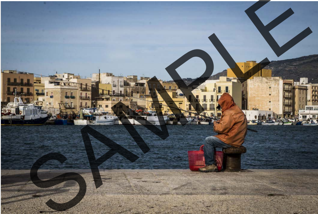
Fisherman in Trapani

If you had one less day, I would've dropped the day in Trapani. It can always be easily reached from Rome and it's better to spend more time in one place, especially an island where you can get to know the locals easily.