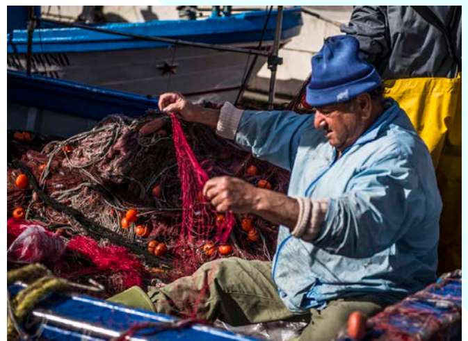
Fisherman on the Harbor